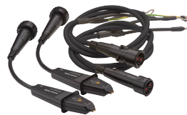
+ DH4-C probe 1.5 m leads