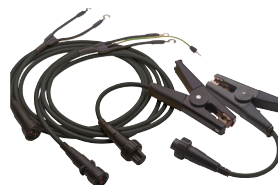
+ KC1 Kelvin clip 3 m leads