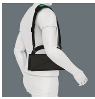
Practical carrying convenience

The Shoulder Strap enables the tools to be suspended over the shoulder and transported accordingly with the hands remaining free. The adjustable-width padding ensures great carrying comfort and convenience.