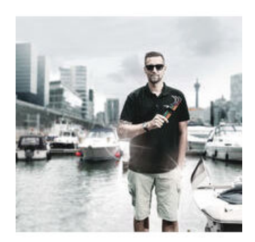
We questioned the classic L-key design, since all too often the screw head recess is rounded out, meaning screws can no longer be tightened or loosened - and so the user finds the L-key slipping out of the recess. Wera Hex-Plus tools have a larger contact surface in the screw head. The notching effects are reduced and thereby the deformation of the screws. At the same time, as much as 20 % more torque can be applied.