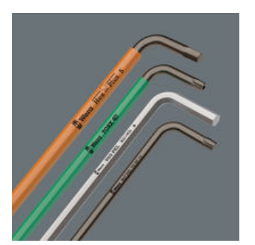
The size of each L-keys has been engraved by a laser. In addition Take it easy L-keys have a colour coding according to sizes - for simple and rapid accessing of the required tool. Making it easy to find the right tool.

Hexagon screws can endure a problem because the contact surfaces delivering the power from conventional the tool, is transferred to the screw via very small surface areas. The consequence: the screw can become damaged (rounding out). Hex-Plus tools have a greater contact surface that prevents this from happening! At the same time, as much as 20 % more torque can be applied. Good to know: Hex-Plus tools fit into every standard hexagon socket screw!