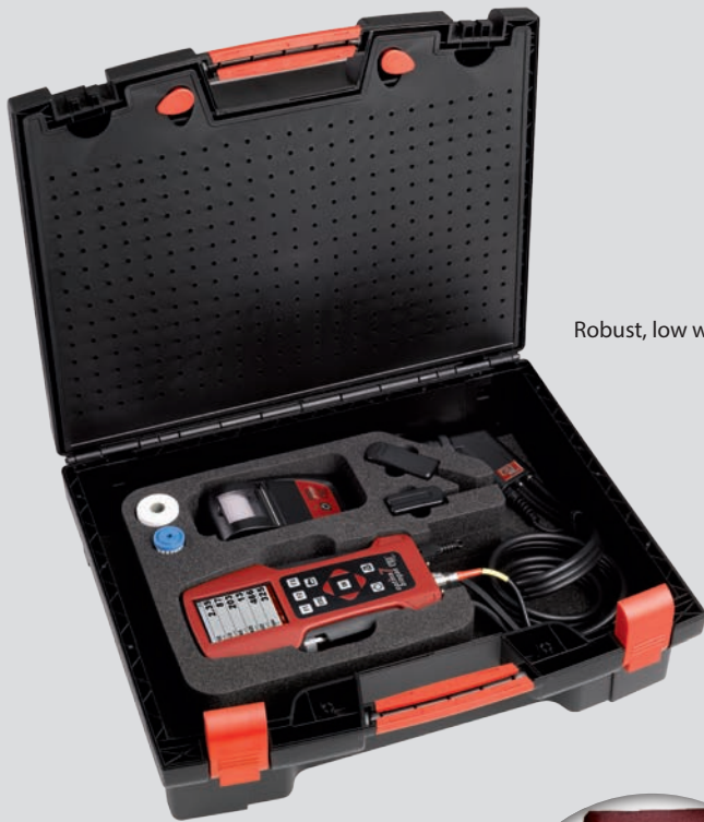
Robust, low weight case