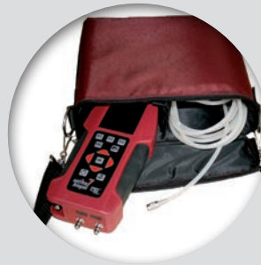
Convenient nylon bag