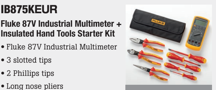
Also available with 3 (IB875L) or 5 (IB875M) screwdrivers