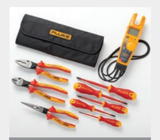
Also available with 3 (IBT6L) or 5 (IBT6M) screwdrivers