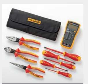
Also available with 3 (IB117L) or 5 (IB117M) screwdrivers